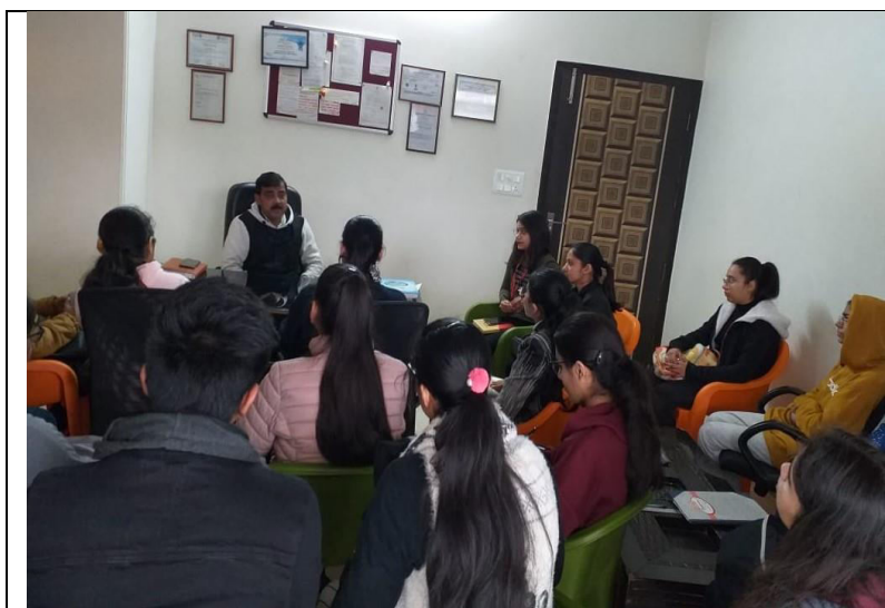
TRAINING ON DRUG AWARENESS

Studies showed that if an individual makes it to 21 years of age without experimenting with drugs, they are highly unlikely to do so. So our chances for success increase exponentially by empowering youth with the facts they can truly grasp about the physical, mental and emotional harm of drugs and their devastating effects on our lives. The Truth about Drugs ( https://www.drugfreeworld.org/course/lesson/the-truth-about-drugs ) is the basic know how about harmful effects of drugs.