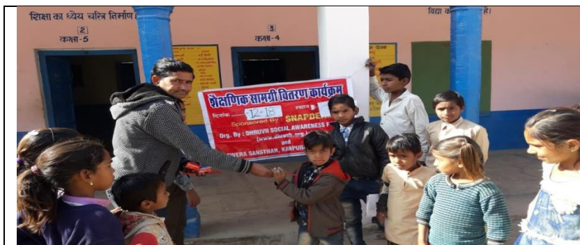
EDUCATION MATERIALS DISTRIBUTION PROGRAM, SPONSORED BY SNAPDEAL

Using the method of Nature friendly life style with holistic approach including alternative therapy like yoga, meditation, reflexology, laugh, spirituality and avoiding animal protein we have achieved tremendous positive result with NO MECINE or very few medication for the acute phase of the psychosomatic problems.