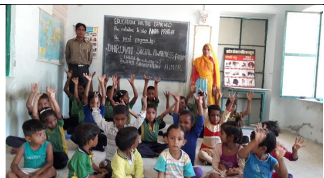
CLASSES FOR NON-PRIVILEGED CHILDREN

With collaboration of Swera Santhan, Ajmer, Rajasthan classes for the non-privileged children, where 42 students are learning their basic lessons simultaneously along with pre-nursery & nursery education.