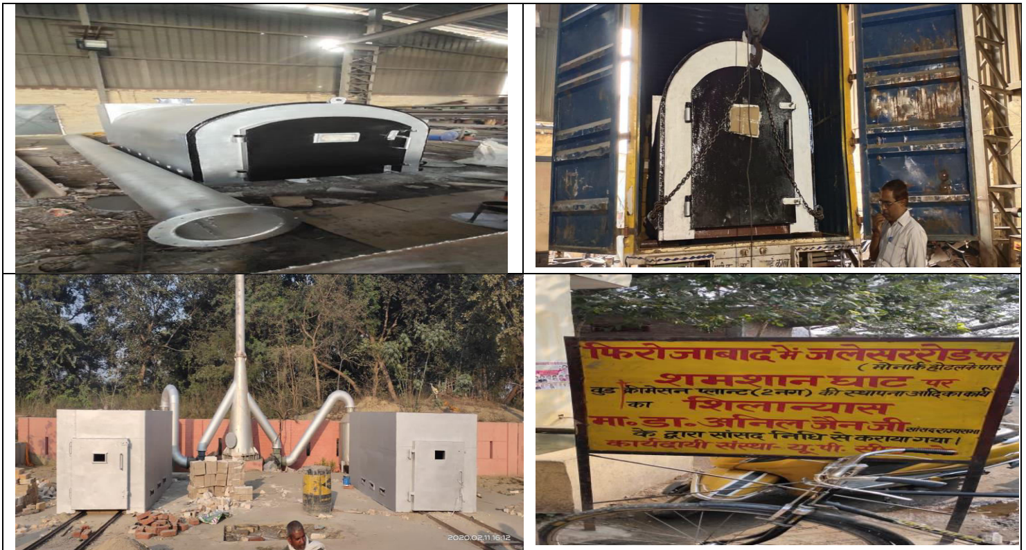
ON GOING CONSTARCTION PROCESS OF OUR ECO FRIENDLY and COST EFFECTIVE WOOD BASED CREMATION PLANT SYSTEM

scrubber , Bed filters, Air Purifiers etc.), with a vision “to provide a solution to save the environment and earth , and minimize the pollution for better future.” This time our projects got momentum & government sectors also has recognized our eco-friendly endeavors.