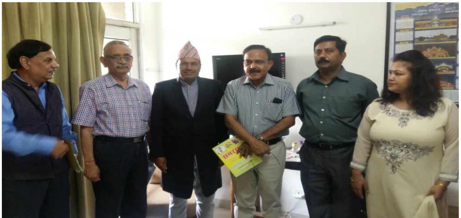
WITH DIGNITARIES OF ANTARRASHTRYA SAMRASTA MANCH, NEPAL, working for spreading the ancient Indian cultural & scientific analyze of Indian (Eastern) Mythology & Spirituality.