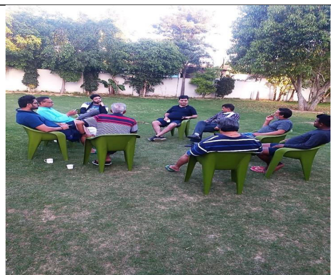
SHARING EXPERIENCE WHO COME OUT OF ADDICTION

We have distributed nearly 1,00,000 books in main languages including English and Hindi. This time we reach nearly 51,000 teenagers including school children and drop-outs, mostly from the slum dwellers. Through our help line and direct contact during program our total counseled individual numbers 11,001.